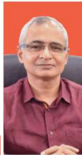
Dr. Neeraj Mittal

Hon'ble Minister of State for communications and Rural Development, Government of India