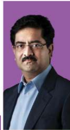
Kumar Mangalam Birla