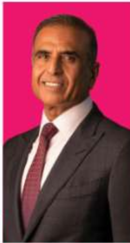
Sunil Bharti Mittal

Chairman, Reliance Jio Infocomm Ltd (RJIL)