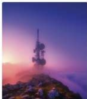
5G & 6G