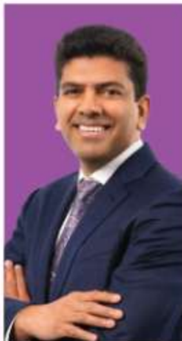
Dr. Pemmasani Chandra Sekhar

Hon'ble Minister for Communications and Development of North Eastern Region, Government of India