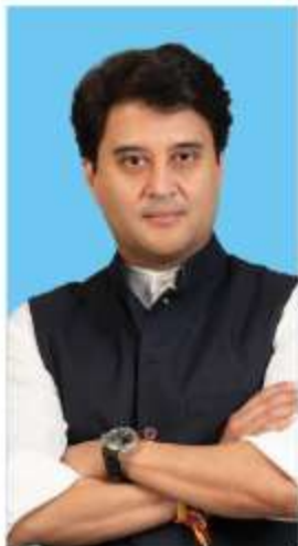
Shri Jyotiraditya M. Scindia

Hon'ble Minister for Communications and Development of North Eastern Region, Government of India